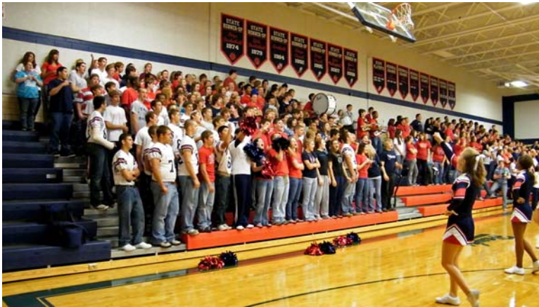
Students enjoyed their first Pep Rally to cheer the Hawks on to victory against Bexley: September 5, 2008.