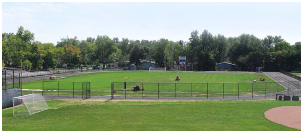
This photo taken September 9 shows the completed track and the fencing installed. Thank you to all of our generous donors for making this possible for our school.