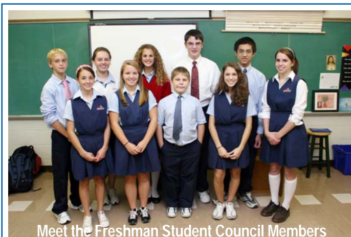
Meet the Freshman Student Council Members

In an effort to keep the Hartley community connected, we are again enclosing a list of directory changes we have received since our October 5 Herald mailing. We thank all those who have updated us. We hope you will add these changes to your directory at home. Additional copies of the school directory are available in the school bookstore for $2 each.