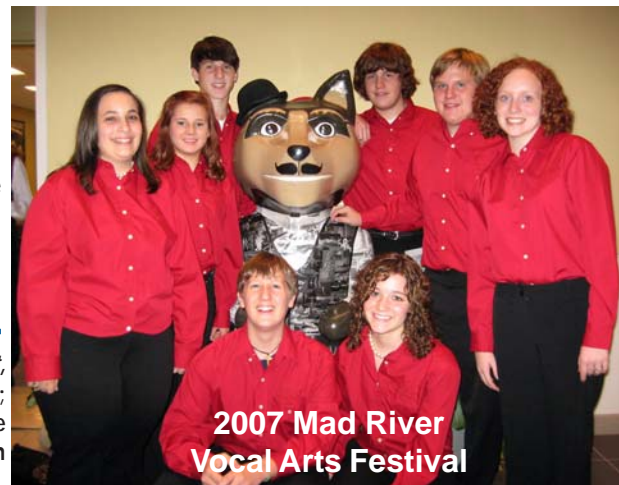
2007 Mad River Vocal Arts Festival